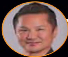
HOSTED BY Grandmaster Tommy Chang